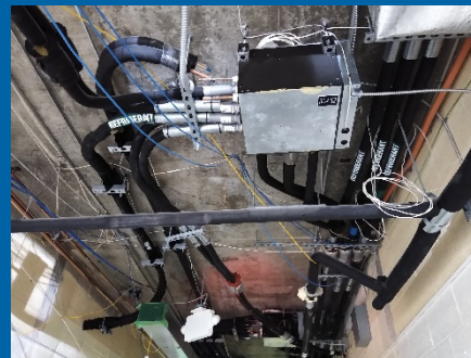
Installation of New VRF Systems in