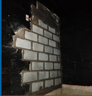
Infill and Patching of Masonry Walls in STEM Lab