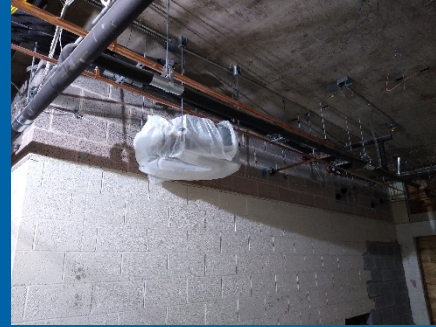
Overhead Rough-In of Plumbing Systems