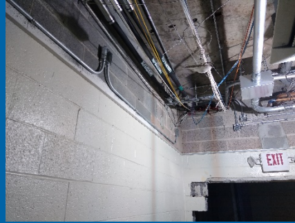
Overhead Rough-In of Electrical Systems